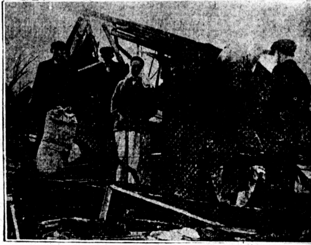
All that was left of their home after the tornado had passed. Suburb of Chicago.