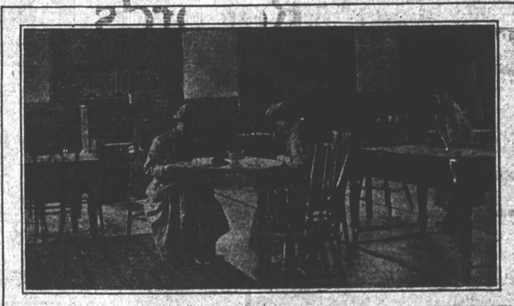
Yes, everything is all very nice and comfortable in this girls' club in London, but think of girls rocking all by themselves—playing pool with themselves, perhaps dancing with themselves in the evening! Wouldn't you, Miss America, get awfully lonesome in such a scene?

some success along this line among my friends, for I think it is quite true that a woman who is married and is happy longs to see her girl friends as pleasantly established in life.