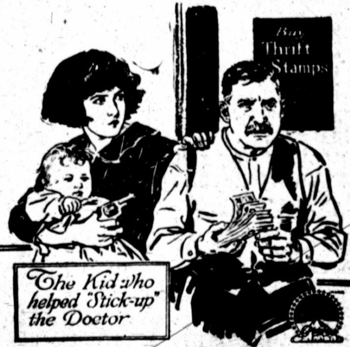
The Kid who helped "Stick-up" the Doctor

You see, they had a Thrift Stamp Drive, and to boost the Drive they had a Baby Show, and Battling Jane's adopted kid won the $500 prize and then the real father turns up and tries to prevent the kid soaking the whole sum in Thrift Stamps. Lord, it's funny!