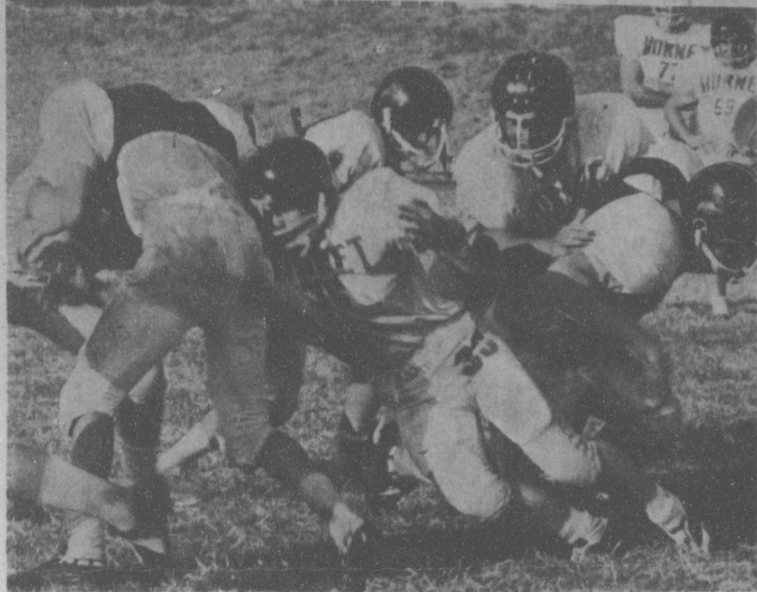
Bruised B-Teamers...The Hornet varsity defense blast through the B-Team offense in the above picture in two-a-day practices last week. The Hornets completed their twice daily work-outs Friday and Saturday night the annual intersquad scrimmage attracted a large crowd.

The Hornets had no significant injuries during the opening week of practice.