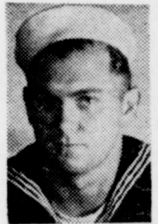
and was last stationed in the Phillippines. He has been in service three years and overseas 7 months.