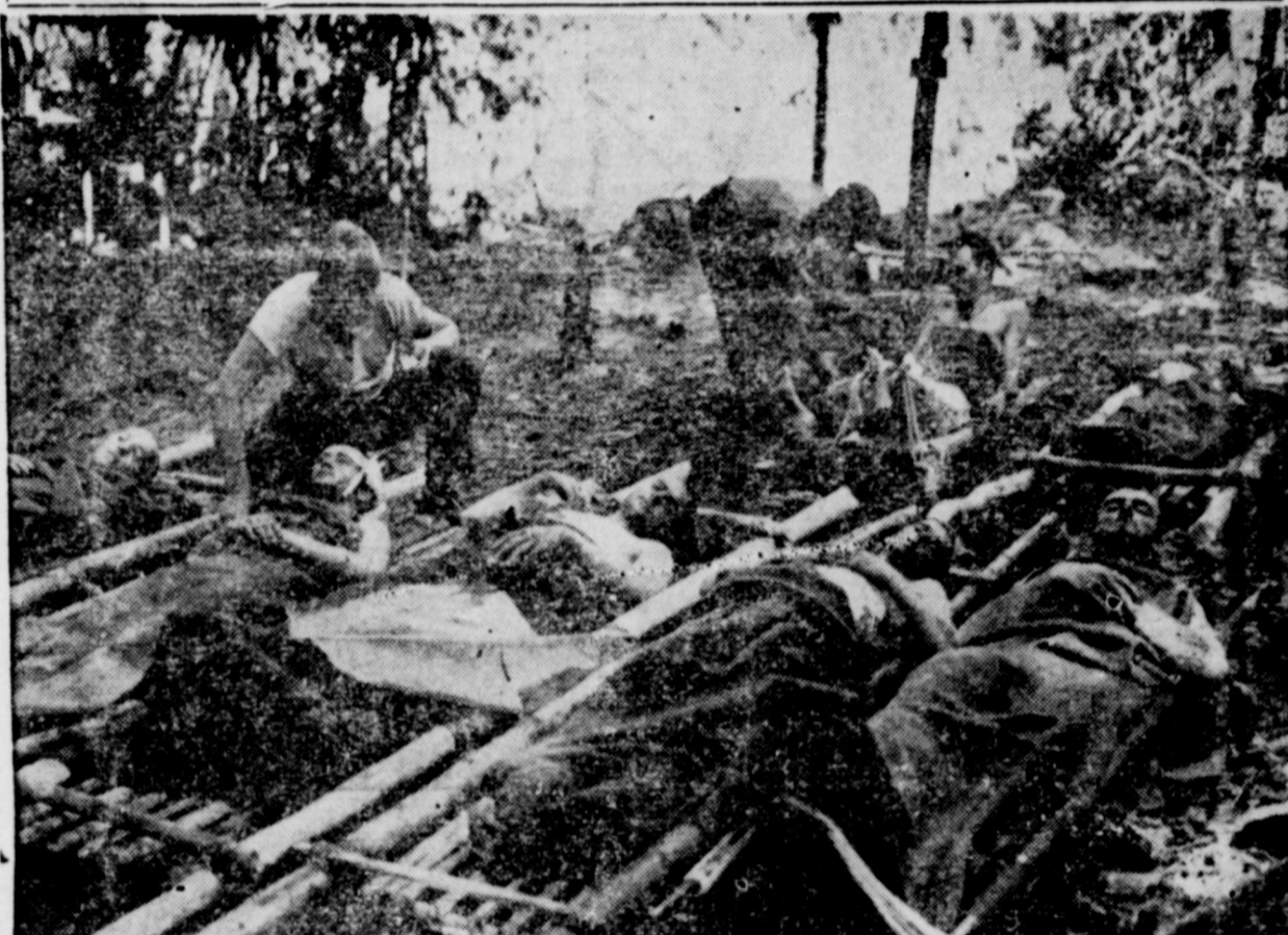
Somewhere in New Guinea these wounded soldiers await evacuation. Flat on their backs, in the steaming heat of the jungle, where mosquitoes plague the air and ants and mosquitoes torment weary bodies, they dream of home . . . of clean white sheets and the touch of cool, comforting hands. You can help provide modern hospitals and the medicines they need for their recuperation by putting every dollar you can into War Bonds during the Third War Loan.