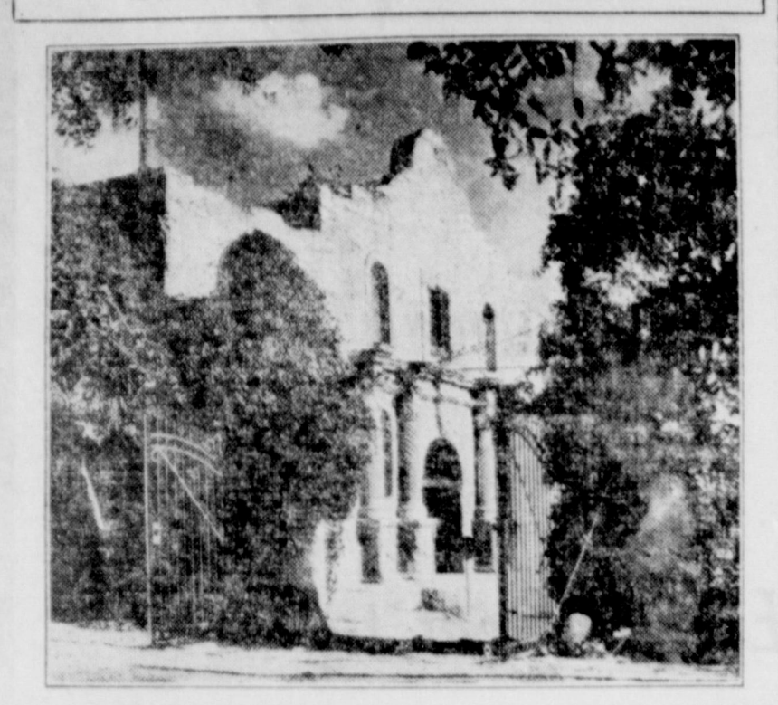
this photograph study of the Alamo against Mexico. One hundred years Mission, historic Texas shrine of Lib-later the Texas Centennial Exposition,

erty, in the center of San Antonio. opening at Dallas June 6, pays tribute Here 182 Texans died to a man, deto the Alamo's gallant defenders.