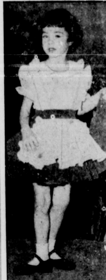
SMALL FRY FASHION —The delicate eyelet apron tops, a louned red velvet skirt to make a pretty costume for this tiny miss, who models self-consciously at a New York fashion show. Eyelet trims the collar and puffed sleeves of the white organdy blouse.

See the revolutionary new HOTPOINT RANGE with double oven