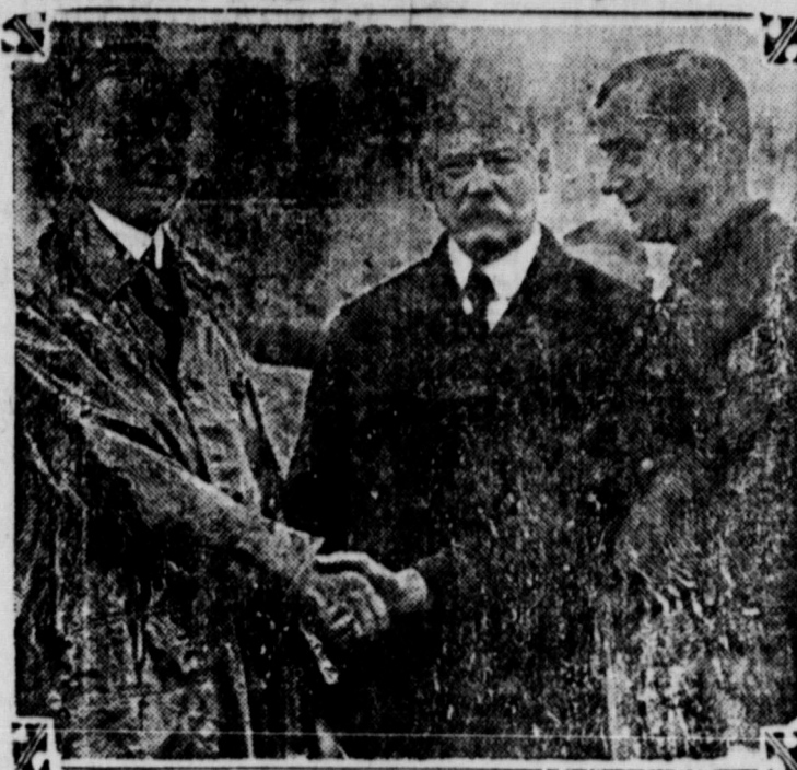
President Coolidge congratulates Lieutenant Lowell Smith, commander of Uncle Sam's round the world flyers on his appointment as chief of a Bolling Field, Washington, Secretary of War Weeks is making on.