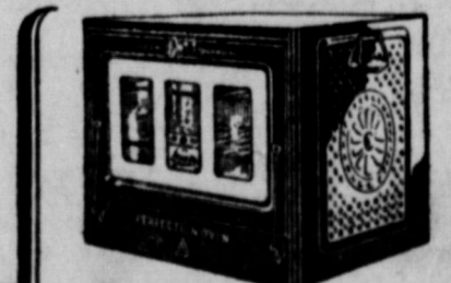
For best results use Perfection Ovens on Perfection Stoves. All styles and sizes.