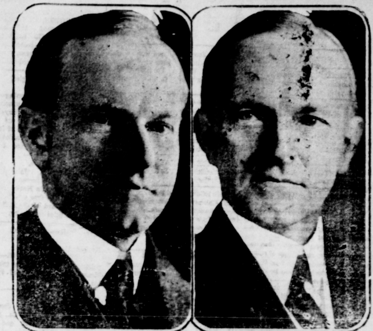
after five months in the White House President Coolidge has suffered no apparent breakdown, as the two contrast pictures above attest. Left: Shows him as he looked upon taking office. Right: As he is today-& physically stronger and healthier man.