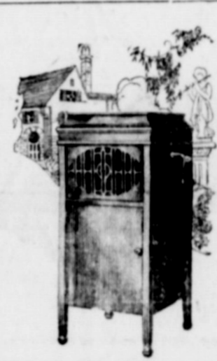
Style 200 $100.00

Hear the Brunswick First — Decide for Yourself.