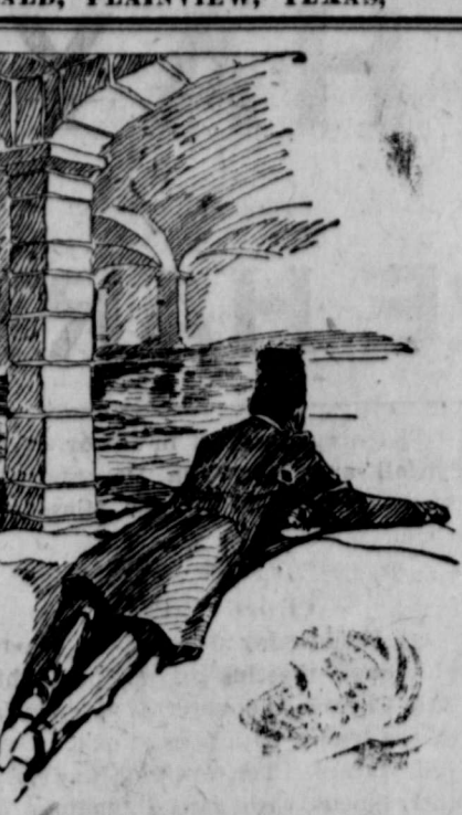
Twenty-Four Hours I Lay In Walt for the Monster to Appear.

the boat, chuckling so horribly that I could not help trembling.