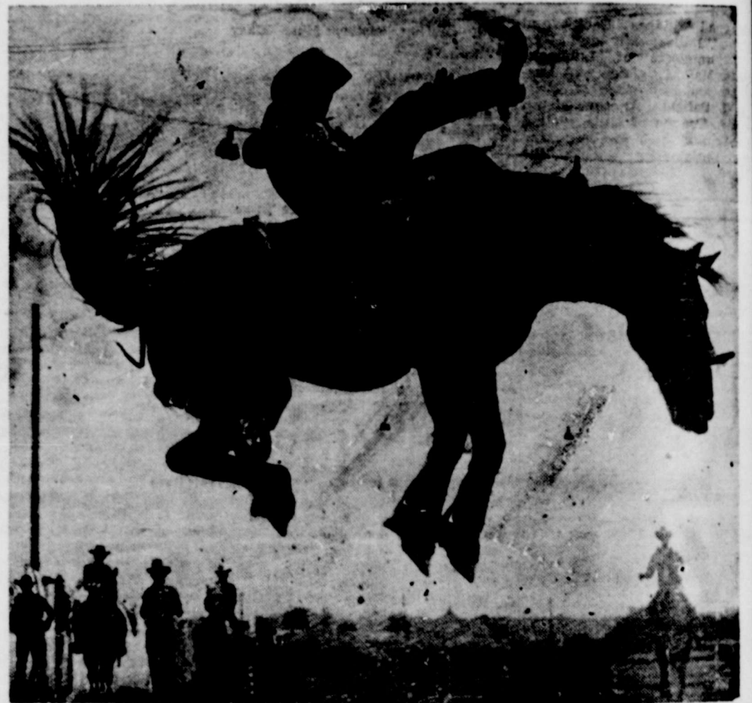
Actual Photo of Dublin Bronco in Action