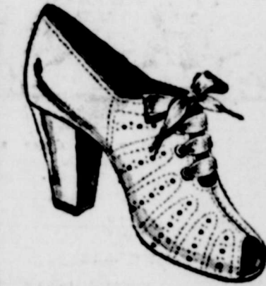
TIE INTO THIS ONE