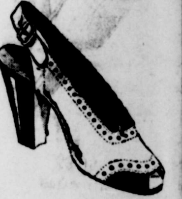
SUGAR AND SPICE