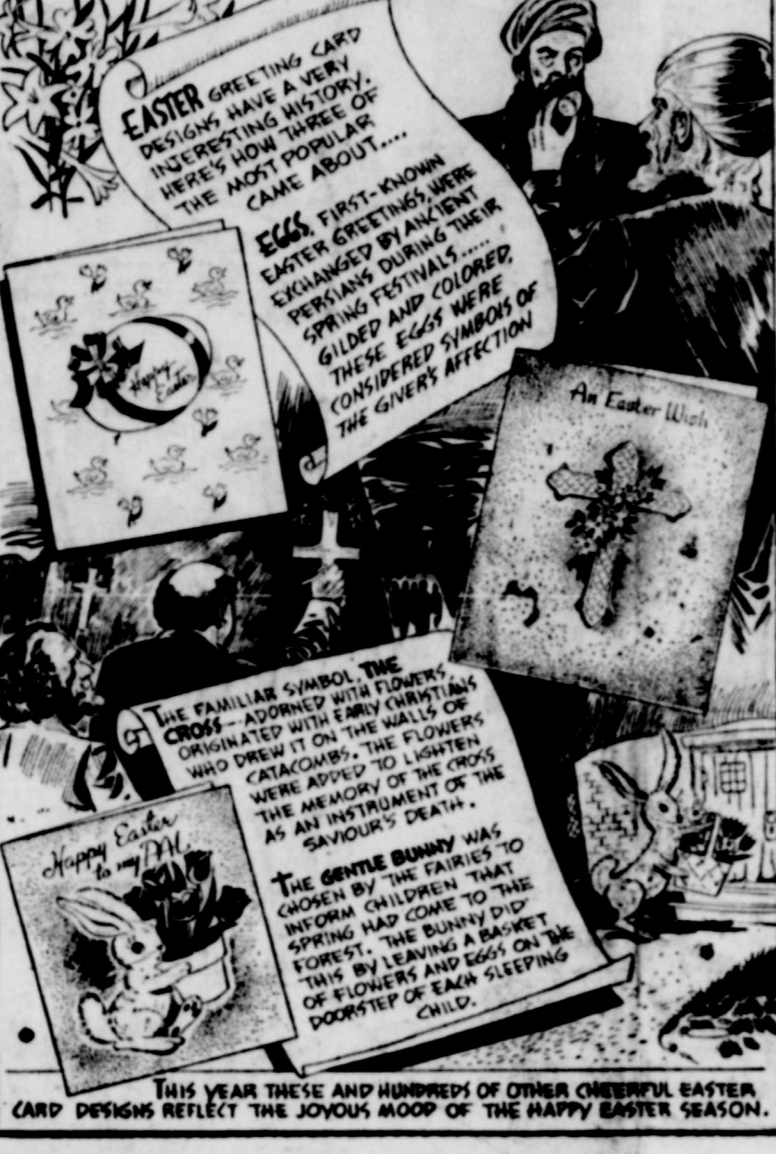
THIS YEAR THESE AND HUNDREDS OF OTHER CHEERFUL EASTER CARD DESIGNS REFLECT THE JOYOUS MOOD OF THE HAPPY EASTER SEASON.