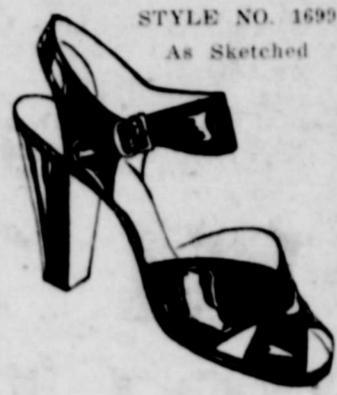
Patent Leather Sandal!

Beguiling little sandal— a bright and shining idea in patent leather. So flattering — so young — so typically Spring! Medium heel. Sizes 4-10.