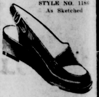
New Low-Down Rhythm for Spring!

A shoe to go to town in from morn 'til night. Heels striking lower and lower notes—rick, black gabardine to play a tune to your feet!