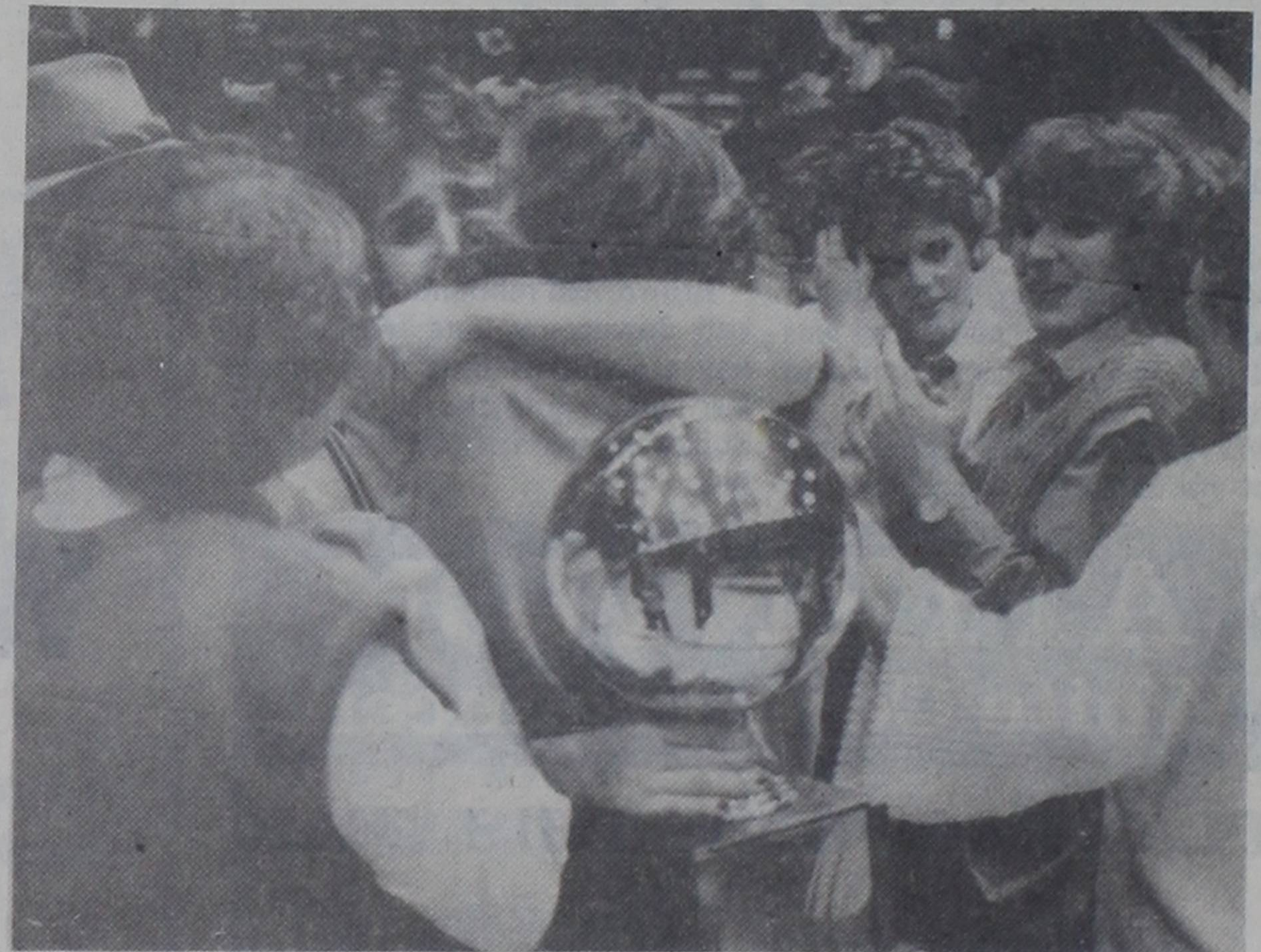
VICTORY CELEBRATION AFTER BI-DISTRICT WIN