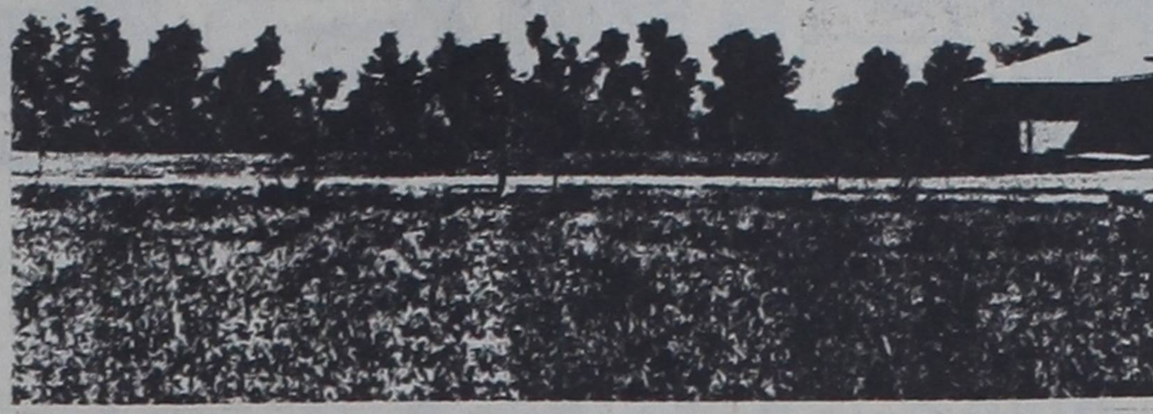
A combination of evergreens and hardwoods makes an attractive and effective barrier.