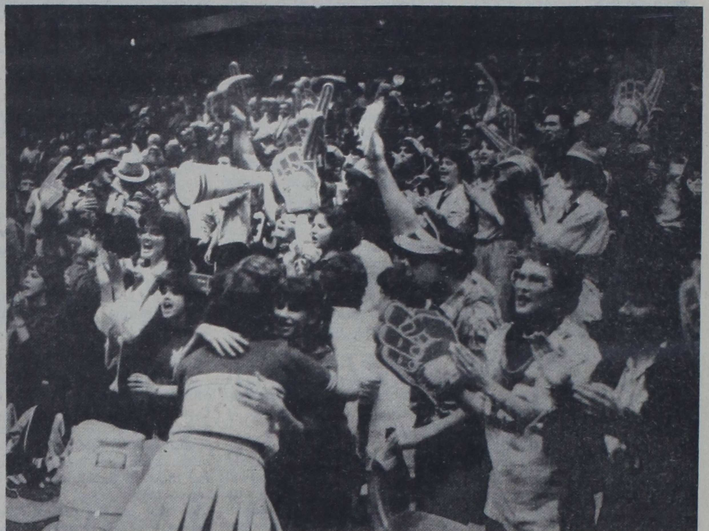
BLEACHER CREATURES.... Among the large crowd of supporters who followed the Friona Squaws in the basketball playoffs were the "Bleacher Creatures," Friona High School students who were loud both in dress and in their vocal support. The above shot was made of the group at the Amarillo Civic Center during the Squaws-Canadian game.