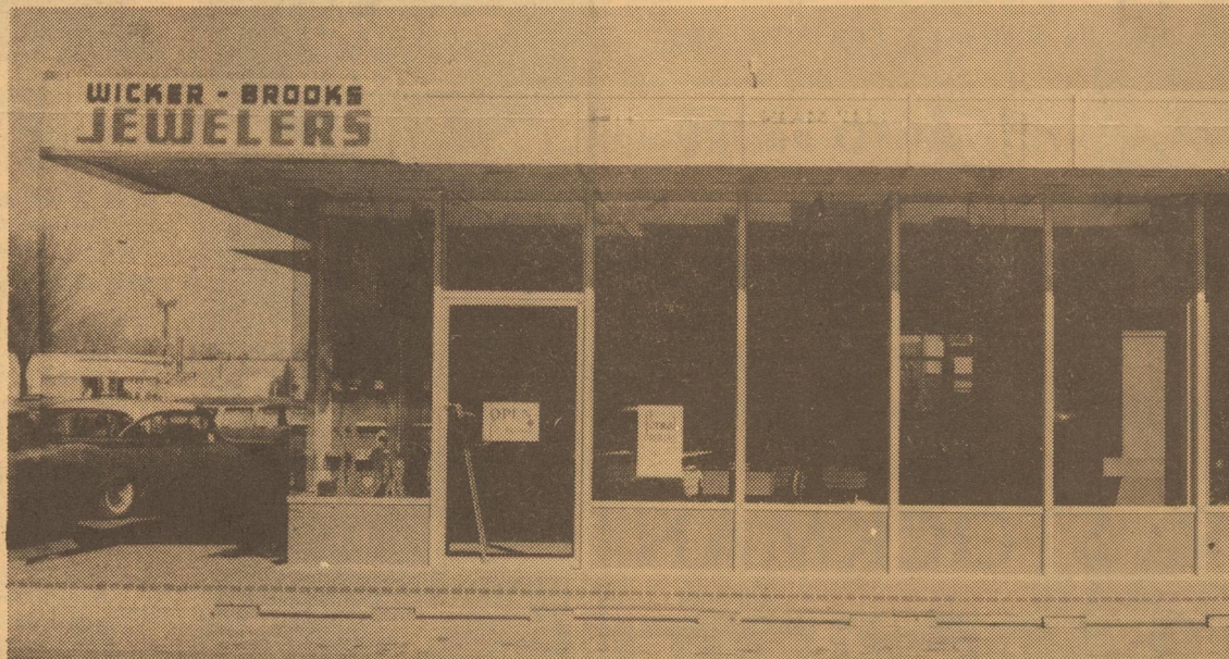
EXTERIOR VIEW OF WICKER-BROOKS JEWELRY STORE LOCATED IN THE STANLEY PAWOL PHARMACY BUILDING.