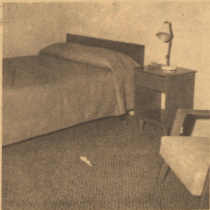
Typical guest room showing the bed with completely carpeted floors and arranged and furnished to please the eye.

Exquately Furnished Accommodations . . . . Gracious Attention And Consideration For The Guest. Luxurious Contemporary Furnishings . . . Twin And Double Beds . . . Magnificent Living For A Day Or Longer At Modest Rates . . . Featuring Guest Controlled Air Conditioning, Television, Telephone, Dell-Peebles Mattresses, And Off-Street Parking.