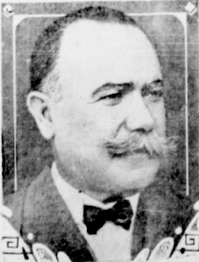
This photograph of the married president-elect of Mexico was taken only shortly before his death and following the demonstration which greeted his arrival in the capital from his ranch home in northern Mexico.