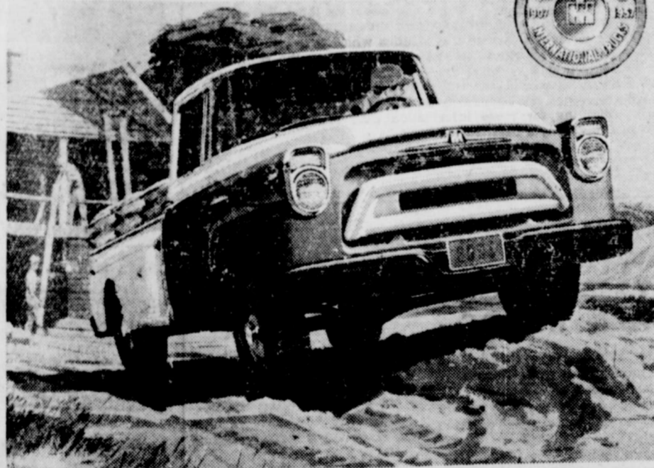
New Golden Anniversary INTERNATIONALS range from Pickups to 33,000 lbs. GVW six-wheelers. Other INTERNATIONALS, to 96,000 lbs. GVW, round out world's most complete line.

Your very first drive in a new Golden Anniversary INTERNATIONAL Truck will sell you on its superior comfort, handling ease and "get up and go."