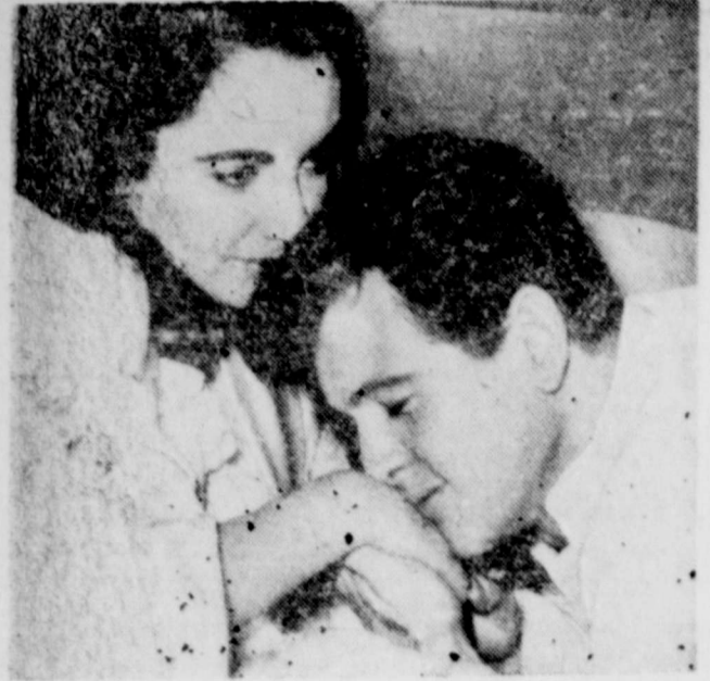
EMOTIONAL SCENE — Elizabeth Taylor and Rock Hudson in an emotion packed scene from an emotion packed picture, Edna Ferber's 'Giant', showing April 26 — 29 at the Rose