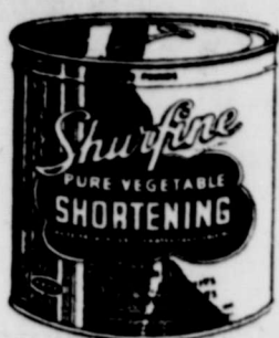
Get it at Your Favorite Grocery