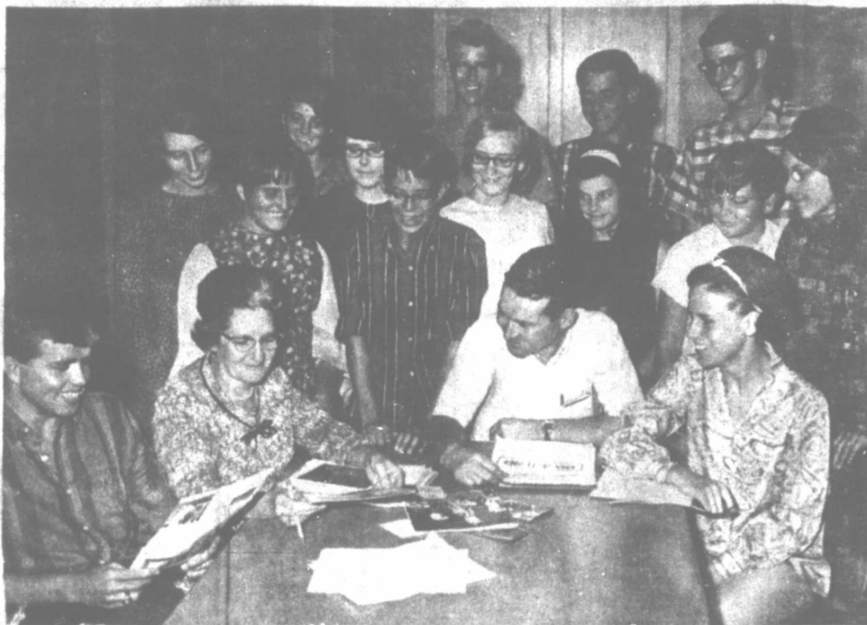
PLAN 4-H WEEK - Shown above are a group of Lamb County 4-H members as they complete plans for National 4-H Week, Sept. 30 - Oct. 7.

The FTC recently warned advertisers of radios it was time to stop this nonsense, and has, in fact, proposed a rule that would require advertisers to drop from the transistor count any dummy transistors that do not contribute to amplifying radio signals.