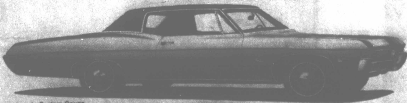
Impala Custom Coupe

exhaust emission control. (3) Proved safety features including many new ones. (4) All kinds of new comfort and convenience: Hide-A-Way windshield wipers, rich new instrument panels, sumptuous new interiors. Chevrolet's best... ever!