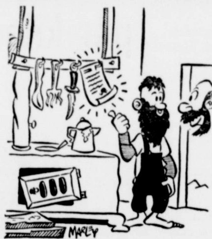
MAW'S GOT ALL OF HER SILVERWARE INSURED BY THIS POLICY WITH

W. BROWN MOTOR Co. McCAMEY, TEXAS Highway 67—East