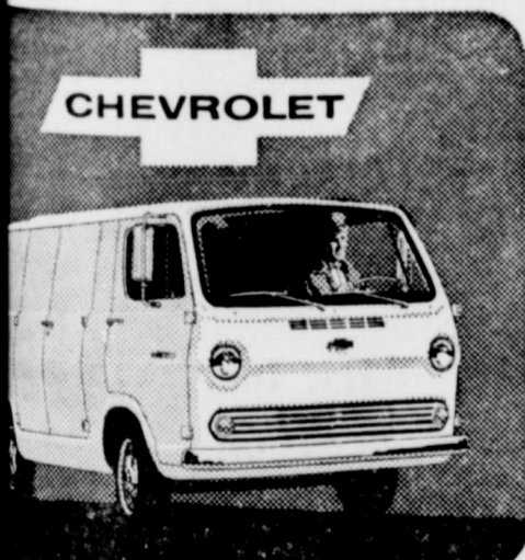
low-cost Chevy-Van—economy champ Chevrolet's long, strong covered delivery line.