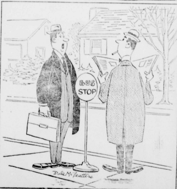
"Funny how you can work for years without getting the habit!"