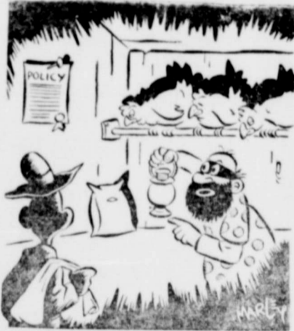
WE CAN'T STEAL TH' MCOY'S CHICKENS THEY HAVE A POLICY WITH