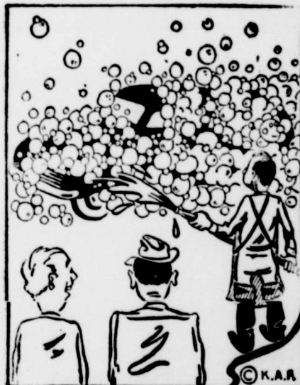
"Musta' got too much Duz-e in the water."

We're really Experts at car washing. Our formula gets the dirt outside and in.