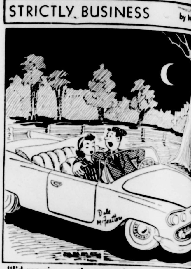
"I'd promise you the moon, Agnes, but the Air Fo has its eye on it!"

Blessed are the poor for they do not have to borrow money with which to pay income taxes.