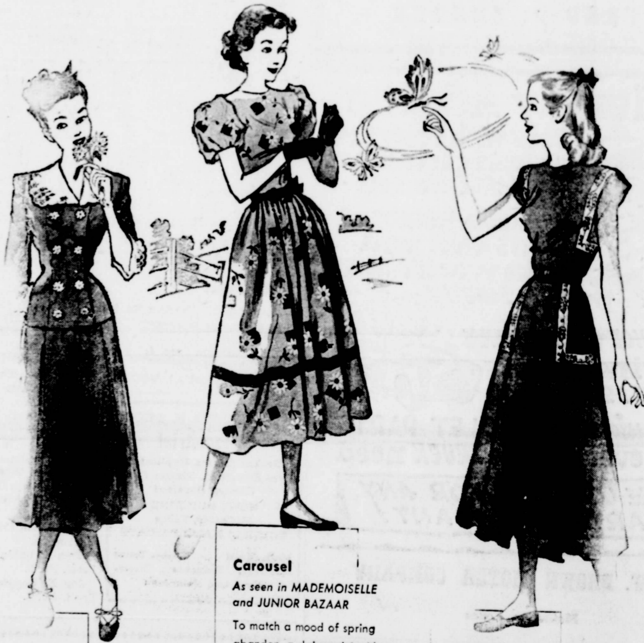
Carousel As seen in MADEMOISELLE and JUNIOR BAZAAR

Summer blooms ahead for typical Carole King girls