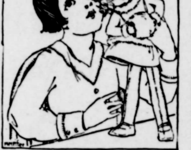
Angelina Adorable Shivered.

"She wears such ugly nightgowns and she natters to herself and she al-