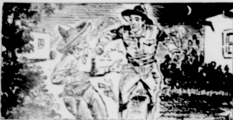
It caught the Mexican on the chin and he slumped.