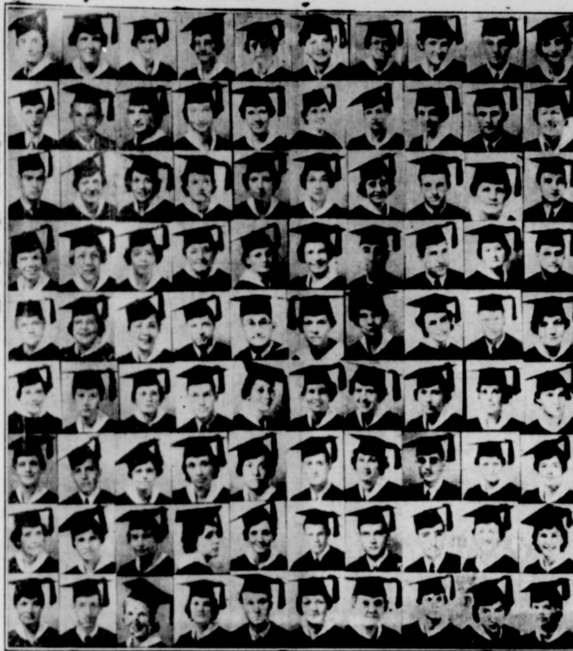
Above are shown most of the 97 members of the August graduating class of Sul Ross State Teachers College—the largest group of seniors in Sul Ross history.