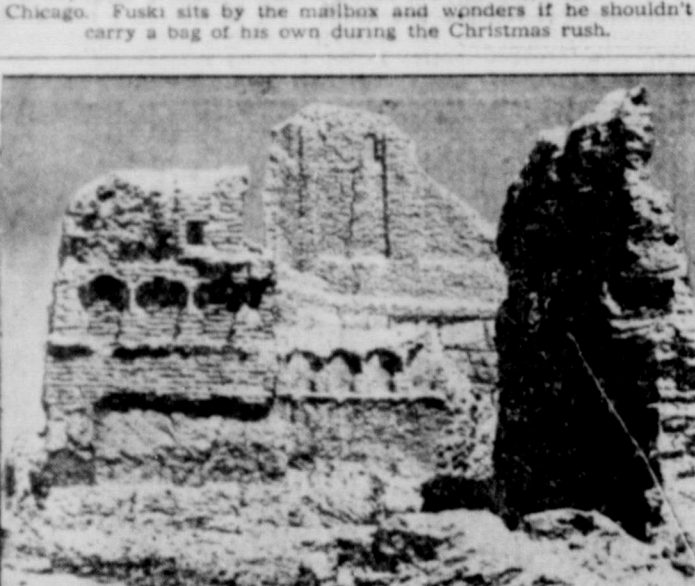
'LOST CITY" FOUND IN DESERT-This is part of an ancient It is believed to be the once great city of Peshawarum, which re-portedly had a population of 100,000 at the time of the Crusades. bled" on the ancient city.