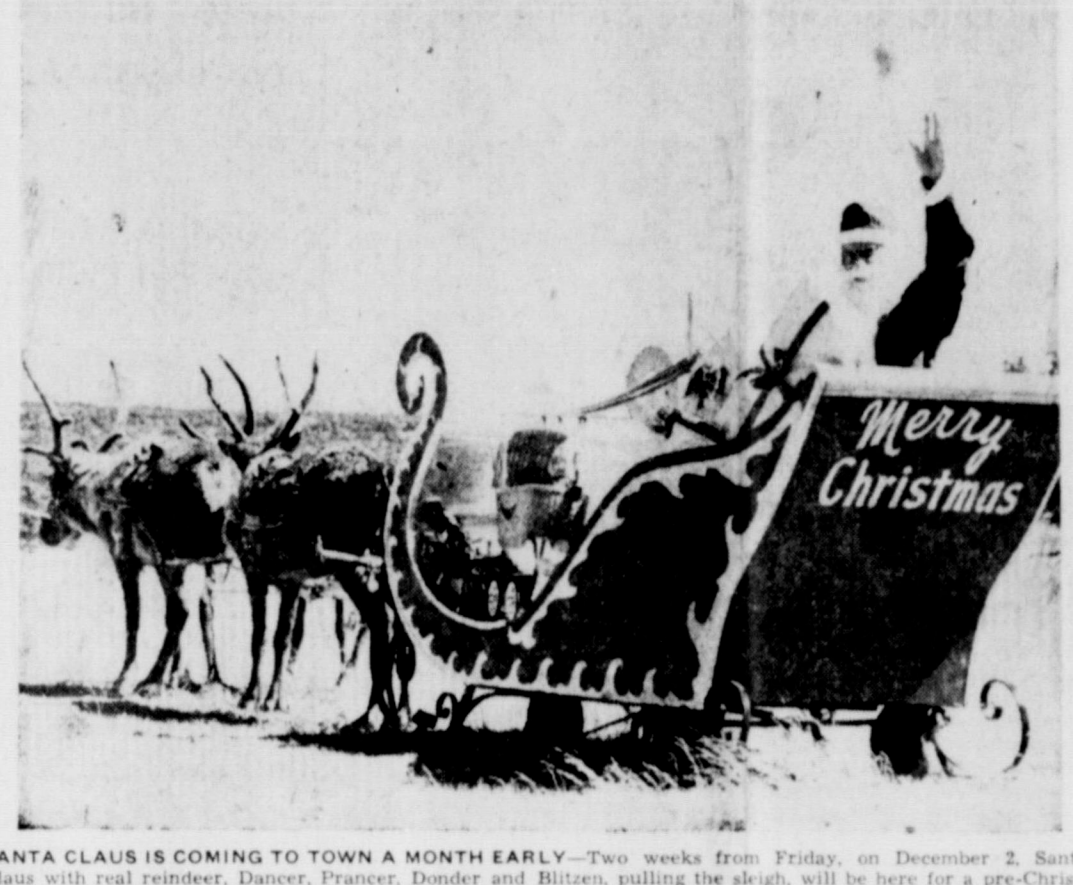
Claus with real reindeer, Dancer, Prancer, Donder and Blitzen, pulling the sleigh, ever, all Christmas lights and decorations will be up by December 2. Merchants are reminded that if the Junior

brance of another experience, which, "Illusion" is about the proper name by the human intelligence.