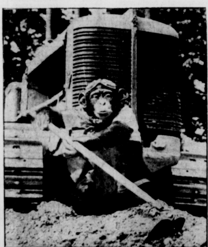
WILLING HELPER - This friendly-looking Pandora Chimp, resident at the Philadelphia Zoo, clears the way for a giant bull-dozer. The task is one of breaking ground for a new lion house at the zoo. If the chimp's doing more than his share, it's probably because he wants to make sure the lions are kept well within