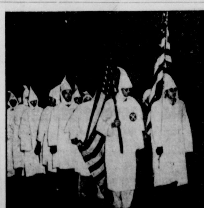
BASHFUL BOYS-At Pell City, Ala., members of the Ku Klux Klan file two abreast into the St. Clair County Courthouse after staging the group's first motor parade since the state outlawed the wearing of masks. Many of the sixty-odd Klansmen wore dark glasses in an attempt to conceal their identity.

row crops, it fell with such force For the third planting, you that some farmers who had some are not having the effect with They are the ones able to with necessary to reseed such fields.