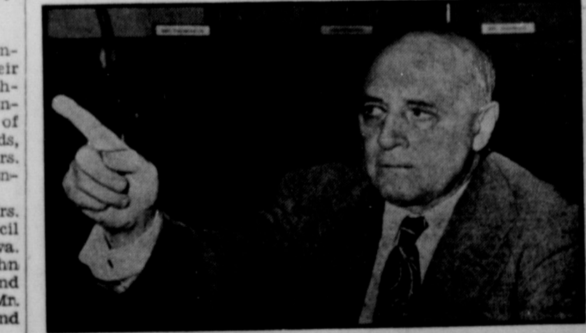
Rep. Andrew J. May (D) of Kentucky points an emphatic finger as he tells House colleagues there are "sinister motives" behind attacks on him in the Senate War Profits Investigating Committee probe of Illinois munitions firms. Testimony involves a check to the Cumberland Lumber Co. endorsed "A. J. May, President." May declared he did not endorse the check and was not president of the company. Kentucky Secretary of State records show "Andrew J. May Prestonsburg"—May's home town—to be president. May is chairman of the powerful House Military Affairs Committee.