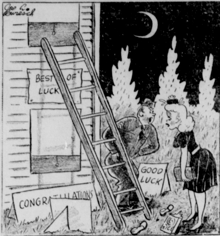
"Our folks didn't know about it, then you rigged up all this—including the ladder!"