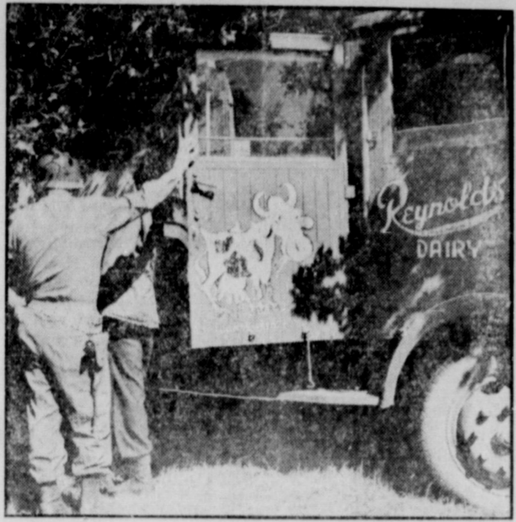
A dairy truck complete with contented cow serves as War Planning Section (G-3) Headquarters for an American division in France awaiting orders to add its weight to the shattering of Germany.