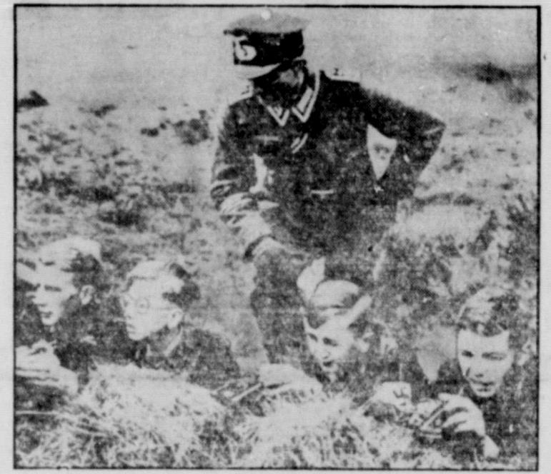
Completeness of Hitler's desperate utilization even of children for defense of the Reich is illustrated in these two pictures, radioed from neutral Stockholm, Sweden. Upper, a German officer is teaching one of a group of knee-panters how to operate a multiple rocket gun. Lower, teen-agers learn how to use military compass.