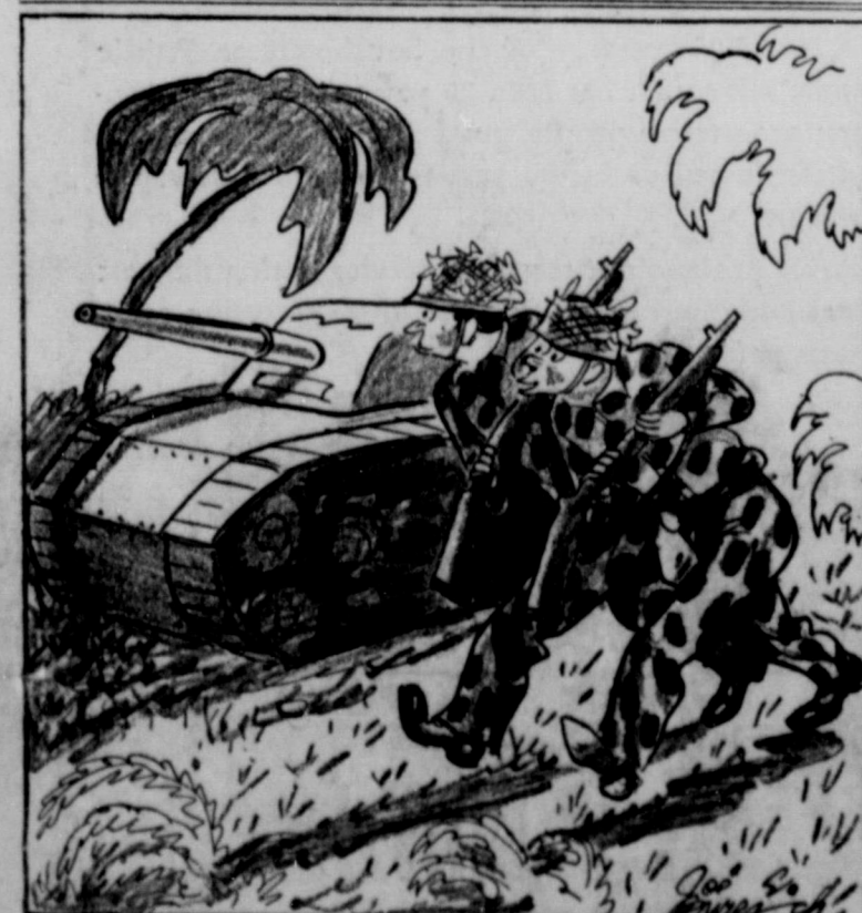
"They're afraid to let me run one of them things—I used to be a cab driver in Brooklyn."