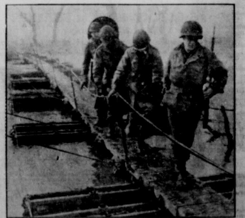
In the new Western Front offensive, a U. S. 9th Army wire team carries drums of communications over a pontoon foot bridge across Roer River in Germany.