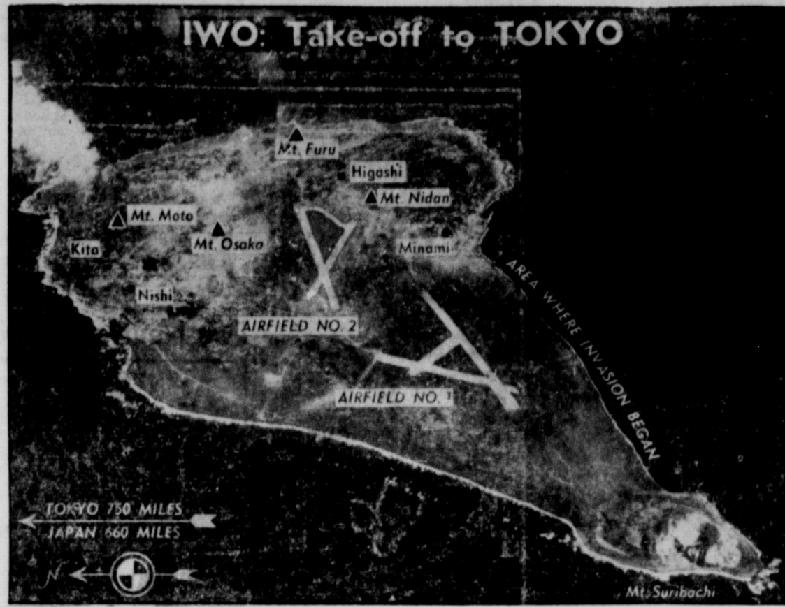
Only 750 miles from Tokyo and 660 from southern Japan, the eight square miles of Iwo Jima will soon be our most important air base in the Pacific so far. For from Iwo land-based fighters can accompany bombers to Tokyo and other Jap industrial cities. Further, there can be more bombers taking off often, carrying greater bomb loads. The Japs consider Iwo part of the homeland, in fact, Tokyo Prefecture administered it. Before the war Iwo's population was around 1100, living in 223 households. Iwo Jima means Sulphur Island. Highest point, Suribachi Yama, or Suribachi Mountain, rises 546 feet.

Other information to be submitted with the lists includes the total number of employees as of Jan. 1 1945 exclusive of part-time employees. Sample copies of the lists and further information of procedures may be ob-