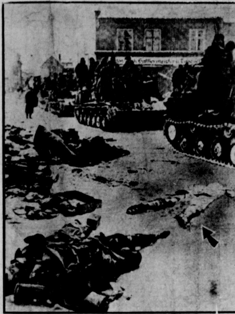
Soviet tanks roll into Muelhausen in the Danzig area, their pathway bordered by dead Germans. Arrow points to a German soldier pancaked flat by tank treads.