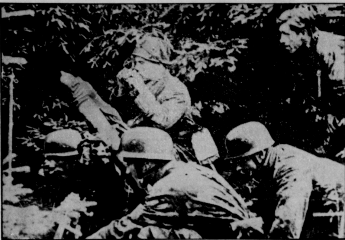
As the Russians sweep onward toward Berlin, this captured German film comes from the Signal Corps showing SS paratroopers attacking a Soviet stronghold with mortar fire.