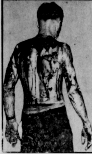
Wounded, burned, and bleeding, a wounded Navy man heads for an emergency sick bay on an invasion vessel in Lingayen Gulf off Luzon.