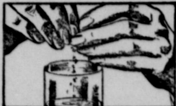
1. Crush and stir 3 BAYER Aspirin Tablets in a third glass of water.