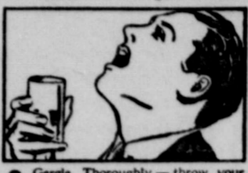
2. Gargle Thoroughly—throw your head way back, allowing a little to trickle down your throat. Do this twice. Do not raise mouth.