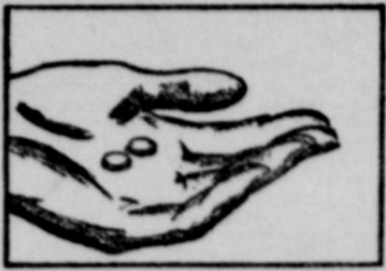
3. If you have a cold, take 2 BAYER Aspirin Tablets. Drink full glass of water. Repeat if necessary, following directions in package.