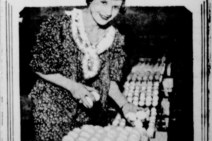
A new machine which processes eggs and makes it possible to keep them fresh indefinitely without storing was displayed at the National Poultry, Butter and Egg convention at Chicago last week. The process seals the eggs to retain the carbon dioxide which is the life preservative of eggs.