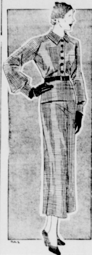
THE VERY LATEST

The program will be given at the First Baptist Church in Quanaah.