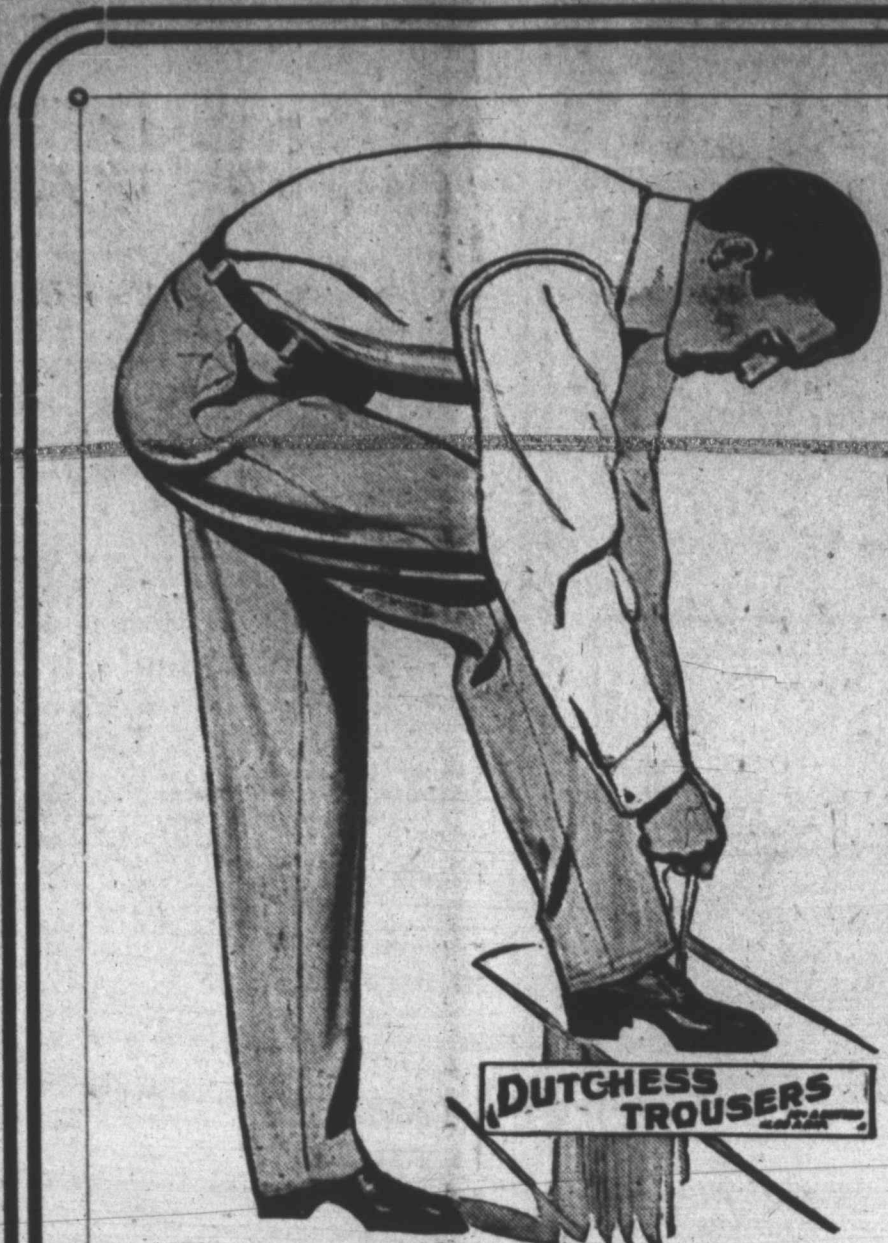
Easy in Any Position.

A large number of our exchanges, especially the Hereford Brand, persist in calling the local Normal college, "The North-west Texas State Normal Col-