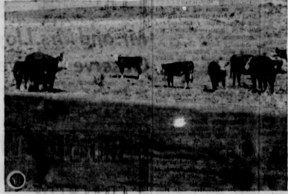
FENCED OUT —Hereford cattle seen over a corral fence at the Buckeye Ranch in Fort Sumner, N.M. Science and mechanization have geared the $8 billion a year cattle industry to the electronics age and the mass market.