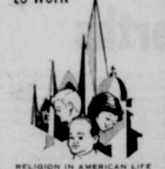
RELIGION IN AMERICAN LIFE

Worship this week -- and put your Faith to work