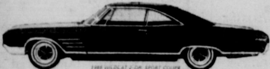
1965 WILDCAT 2-DR. SPORT COUPE

Good news for patient people. The '65 Buicks are in production again. And lots of new Buicks are on their way to us. Help us send your favorite on its way to you. Come in and order the Buick you want.