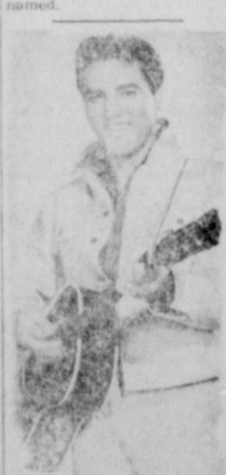
Majestic April 8-10