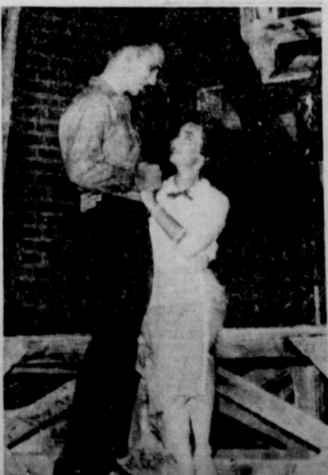
A SCENE FROM "DERRICK TOWN"