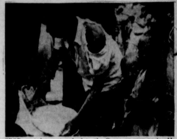
CROP started exporting food to the Congo as soon as trouble started in 1960. There were reports of more than 200 people dying of starvation daily at the end of 1960. The CROP foods, shipped through Church World Service, have been of great value in helping the people of this newly independent nation through a period of severe crisis. "Give us this day our daily bread," has great meaning for most Congolese, who look to CROP and CWS to help them stay alive. M-61-1