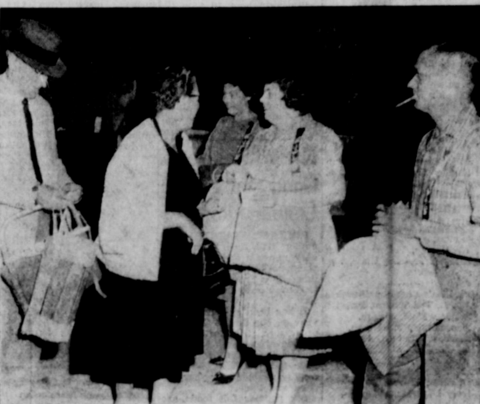
GET YO PILLAS RI HEAH — Caught in the act of serving fans with that added comfort are members of the Ranger Athletic Booster Club. The club rents pillows at every home game as a means of raising money to help pay for the game films. The pillows were put to little use as most fans were on their feet half the time.