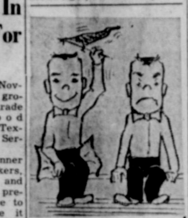
Which Twin Is Enjoying The Game More on an ATHLETIC BOOSTER CLUB PILLOW? Rent One at Every Home Game—Only 15c

Six popular fall foods are particularly abundant, this Thanksgiving Month. They make up the U. S. Department of Agriculture's official list of plentiful because supplies act-