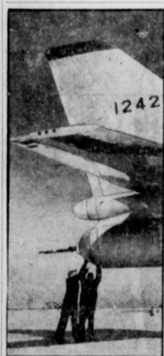
REMOTE-CONTROL STING—This 4-47E Strojlet, being fitted at Wichita, Kan., packs a remote-control sting in her tail. The turret, mounting a twin 20-mm. cannon, depends on recognition of an "enemy" image on a radar screen. Once sighted, automatic devices supply firepower when the foe is in range—unless the operator counteracts the "brains" order. A GE development for the huge Boeing ship, it operates on an all-weather basis.