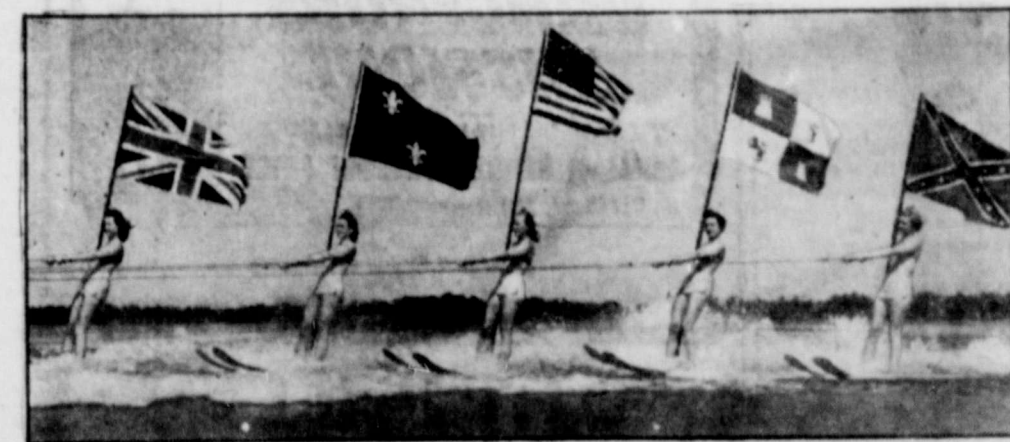
INTERNATIONAL EMBLEMS—No matter what flag they fly, beauties acquire an allegiance of admiration from all the boys everywhere. These lovely water skiers performed, from left, under the flags of Great Britain, France, the United States, Spain and the flag of the Confederate States of America, during a festival at Pensacola, Fla.