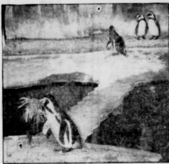
WHO CARES?—"Pierre" doesn't. It's sufficient that he's been brave enough to cross this thin bridge at Vincennes Zoo, in Paris, France. The deep-freeze put on by the penguins on the other side makes no-never-mind. Pierre has a bouquet for the lady of the air-conditioned Arctic evening—so who cares? (Says Pierre.)