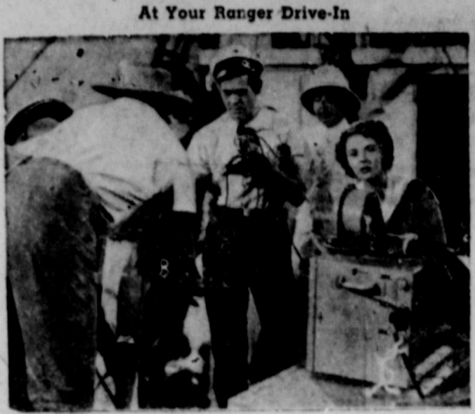
Screen suspense reaches a new high when deep sea diver Anthony Quinn is trapped undersea in this exciting scene from Universal-International's Technicolor "City Beneath the Sea," starring Robert Ryan, Mala Powers, shown above, Quinn and Suzan Ball. Hilo Hattie heads the film's large supporting cast. Playing Tuesday, Buck Night, at your Ranger Drive-In.