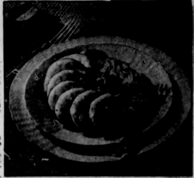
Shrimp Remoulade, on a bed of shredded lettuce, is a sea-food favorite wherever you go.

Shrimp Remoulade (Makes 3-4 servings) Clean, cook and chill 1 pound fresh or frozen shrimp. Combine 2 tablespoons vinegar, 6 tablespoons olive oil (or half olive and half salad oil), 2 teaspoons paprika, ¼ teaspoon salt, ¼ teaspoon pepper, 1½ teaspoons prepared mustard and 1 tablespoon grated horseradish. Add 2 tablespoons minced parsley, ½ cup minced celery and 1 tablespoon minced scallions or onion. Blend thoroughly. Chill. When ready to serve place the chilled shrimp on a bed of shredded lettuce (about half a small head). Pour the chilled sauce over shrimp.