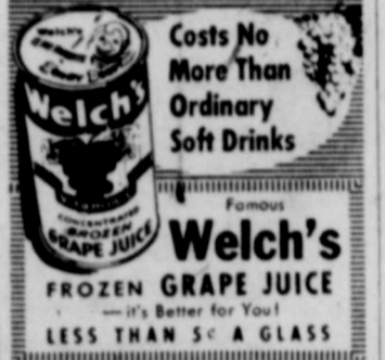
Costs No More Than Ordinary Soft Drinks. Famous Welch's FROZEN GRAPE JUICE — It's Better for You! LESS THAN 5¢ A GLASS