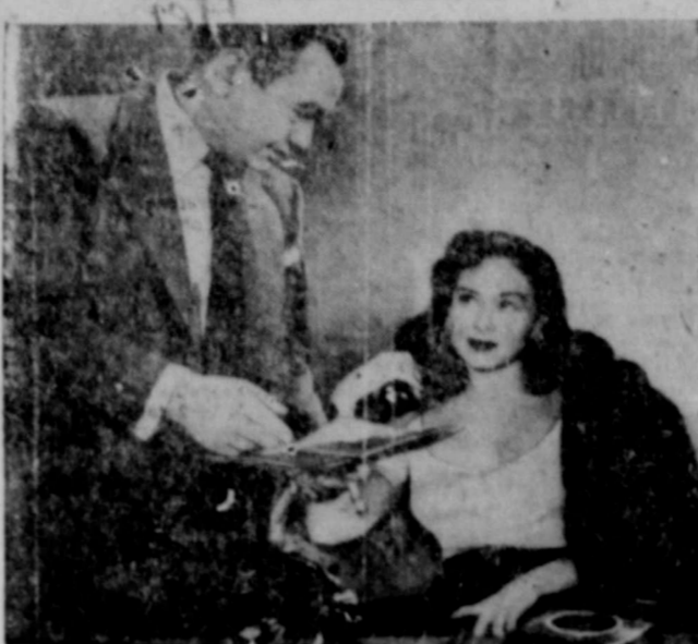
On Your Towers Wide Screen

Edward G. Robinson plays the role of Captain of Detectives in the film expose of big city crime, "Vice Squad" which co-stars Paulette Goddard who is the head of an escort bureau who helps the detectives by giving them valuable information. "Vice Squad" is playing Tuesday and Wednesday on your Tower Theatres giant wide screen.