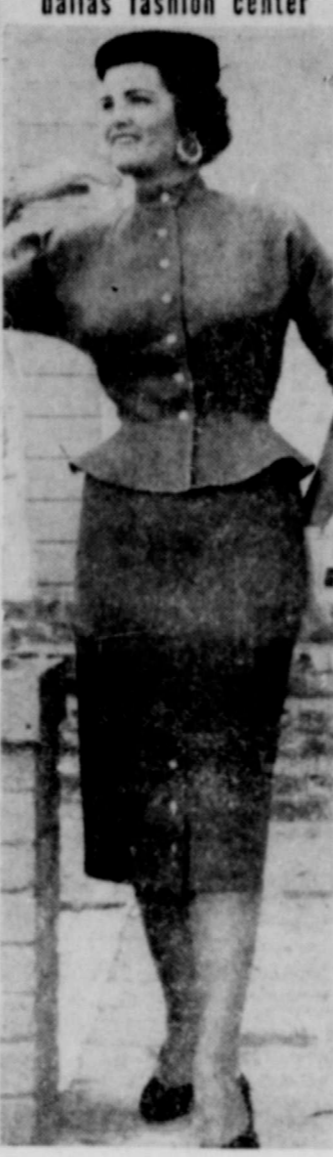
STITCHING accents the mandarin neckline, the jacket peplum and the slim buttoned tier on the skirt of this washable suit of rayon linen by Movietone of Dallas, photographed in luggage.