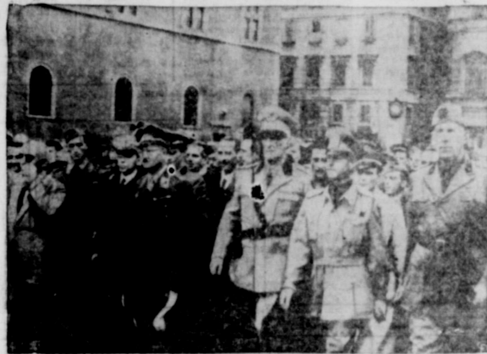
GLORIES OF ROME apparently will not remain much longer within the province of the Nazis and Fascists as the Allies close in on the capital. German and Italian officials, led by Marshal Rodolfo Graziani, third from right, Mussolini's minister of war, are pictured above strutting across the Palazzo Venezia in Rome. At left is German commandant of the city and at right is General Ricci.