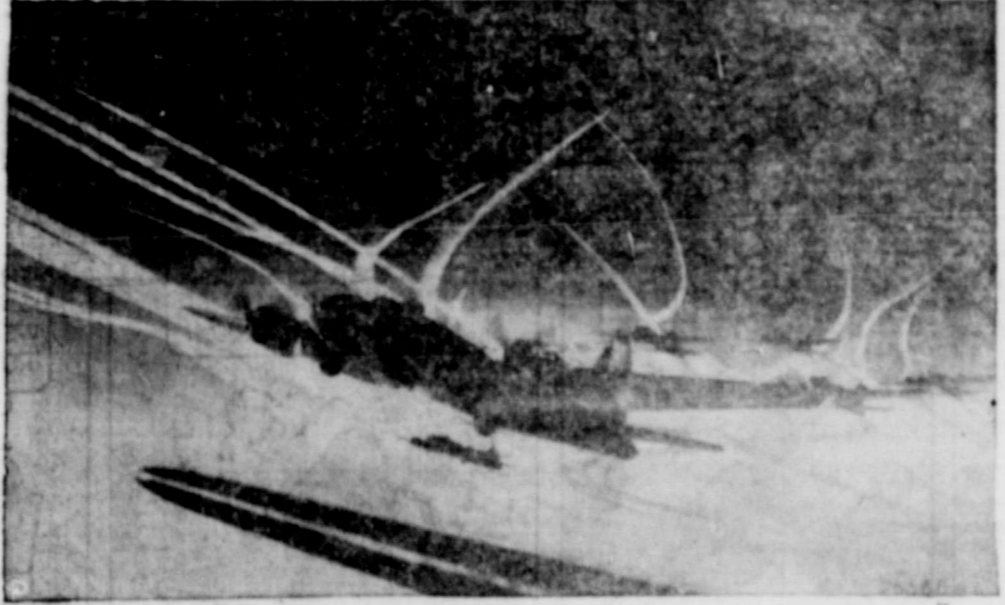
U. S. FLYING FORTRESSES AND FIGHTER PLANES give the appearance of Mars-like monsters as they leave weird trails of vapor in the sub-stratosphere en route on a bombing mission. The curved trails, leading upward, were made by the fighter planes. The famed and deadly 50-caliber machine guns are plainly visible on the Flying Fortresses.