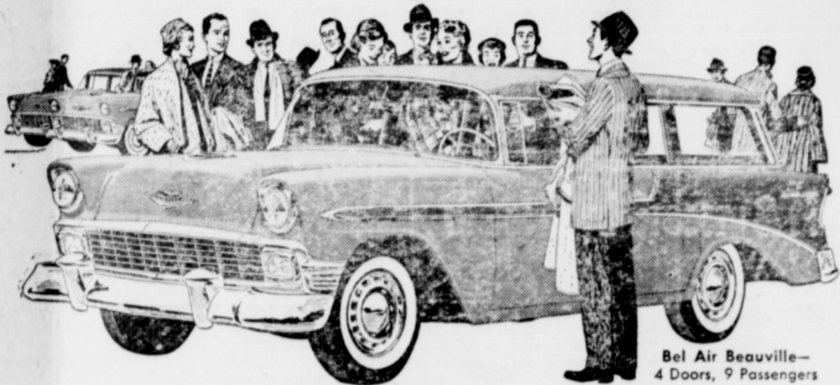
Bel Air Beauville—4 Doors, 9 Passengers

Chevrolet offers you a choice of six sprightly new station wagons—including two new 9-passenger models—all with beautiful Body by Fisher, all with plenty of cargo space, all with new horsepower ranging up to a hot 205!