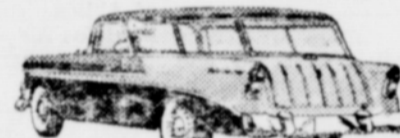
Bel Air Nomad—2 Doors, 6 Passengers