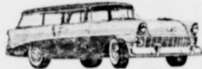
"Two-Ten" Handyman—2 Doors, 6 Passengers