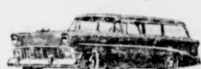
"Two-Ten" Townsman—4 Doors, 6 Passengers