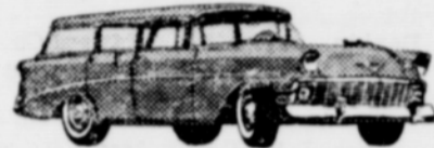
"Two-Ten" Beauville—4 Doors, 9 Passengers

Here's a zippy, exciting kind of power that's fun to handle. And the closest thing to sports car performance—split-second steering reaction and the knack of holding fast around curves—that you'll find in a full-size automobile. Seat belts, with or without shoulder harness, and instrument panel padding, are optional at extra cost. Safety door latches and directional signals are standard. Come in soon and drive a real road car!