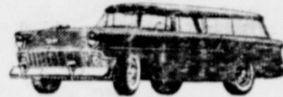
"One-Fifty" Handyman—2 Doors, 6 Passengers