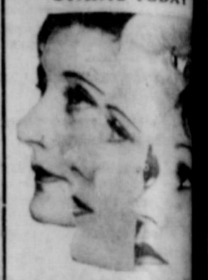
Kissed by three—it meant nothing to him. But what about the lady?

SHOW LADIES BEHAVE Lionel BARRYMORE Alice BRADY with CONWAY TEARLE MARY CARLISLE Katherine Alexander From the Stage "The Vinegar Tree"