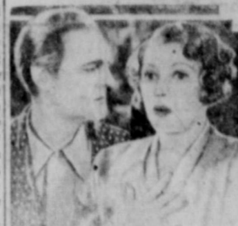
Lionel Barrymore and Alice Brady in "Should Ladies Behave," which is based on the famous stage play, "The Vinegar Tree."

playing Christmas games and singing songs.