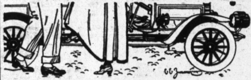
Copyright 1909, by C. E. Zimmerman Co.—No. 6