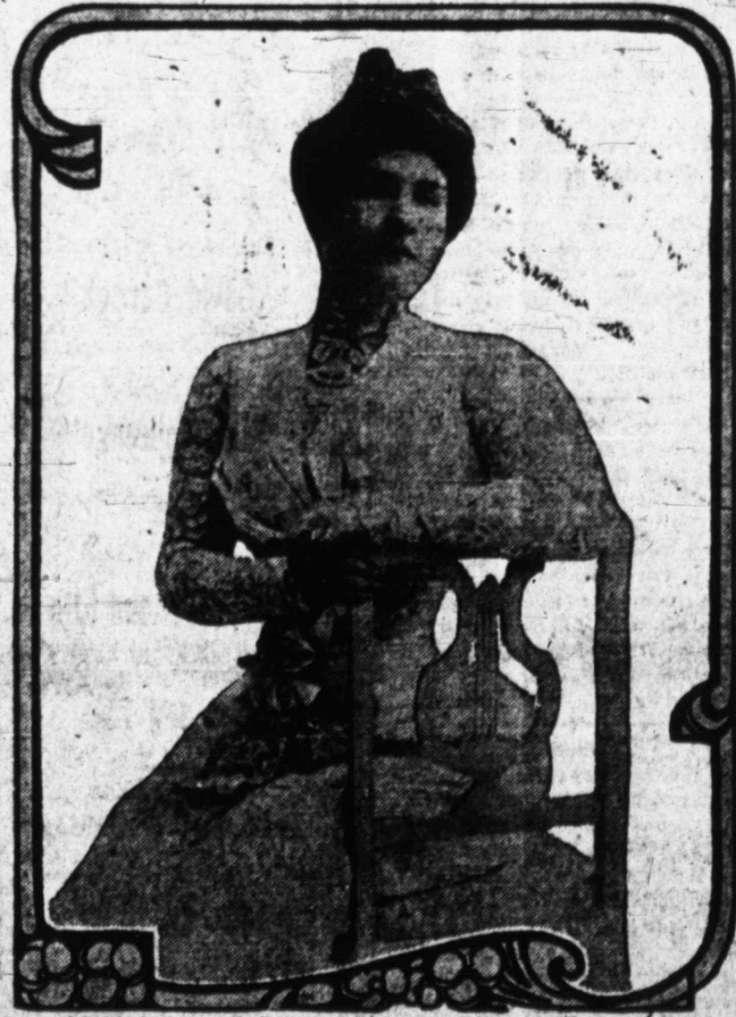
MME. MARGUERITE STEINHILL, WHO FACES TRIAL FOR DOUBLE MURDER IN PARIS.