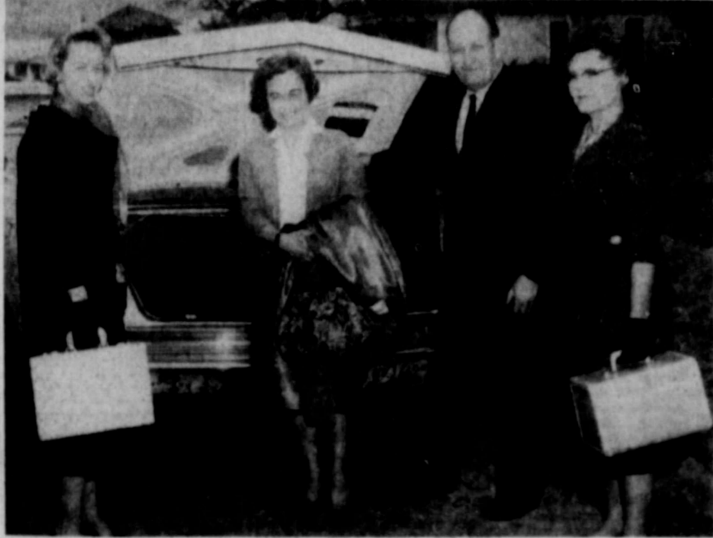
INAUGURAL BOUND—The above group left Ranger Saturday morning on their way to Washington, D. C. where they will attend the Presidential Inauguration activities.